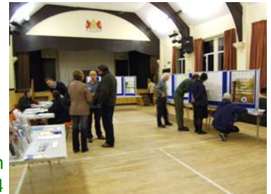
The busy Strathblane session

The results from all the questionnaires returned so far have been analysed and you can get a short overview of what they said from the report made to the Stirling Area Local Access Forum. You can find it on our website by following the links under core paths plan to progress and survey.