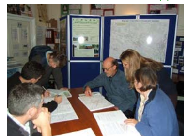
Discussing things at Doune

If you'd like to take a look at a copy of the Draft Stirling Council Core Paths Plan then copies can be found in all the local libraries, local council offices and the Stirling auction marts or you can always take a look online at www.stirling.gov.uk/countryside .