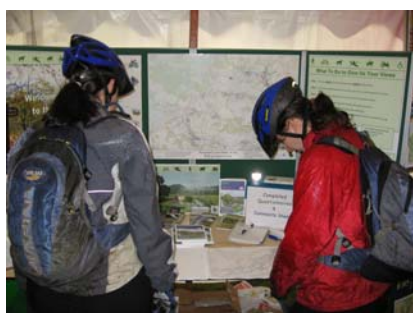
Carron Valley Bike Festival

Thank you to everyone who came along to the drop-in sessions! The turnout was tremendous! We held 44 meetings between July 2006 and July 2007 with a total of 1437 people coming to have a look at our display. Attendance did vary with more people turning out in the west of the area than the east and Stirling but this didn't surprise us too much. The top turnout by far was in Dunblane.