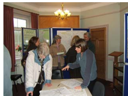
Dunblane meeting Feb 2007

Between July 2006 and May 2007, we toured the entire Stirling Council area to bring the Core Paths Plan Roadshow to a venue near you. Every community wholly within Stirling Council hosted an afternoon and an evening drop-in session. Residents were invited to come along and have a look at the plan, discuss any matters with Countryside staff and to make comments. We held joint events for those communities partly in the Stirling Council area and partly in the Loch Lomond and the Trossachs National Park Authority area.